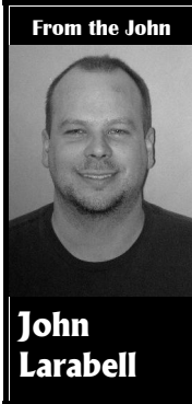
From the John

We've all heard the horror stories of how people were billed for different jobs. We've all watched the Problem Solvers on TV go searching for the roof guy who stole the senior citizen's life savings. We always wonder how repair people come up with a price. Was it fair? Is he honest? Did he really charge me the right amount?